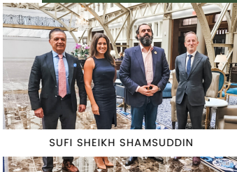
SUFI SHEIKH SHAMSUDDIN