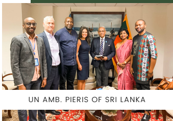
UN AMB. PIERIS OF SRI LANKA