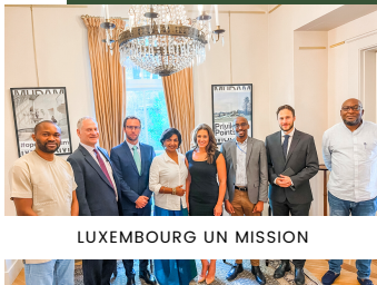
LUXEMBOURG UN MISSION